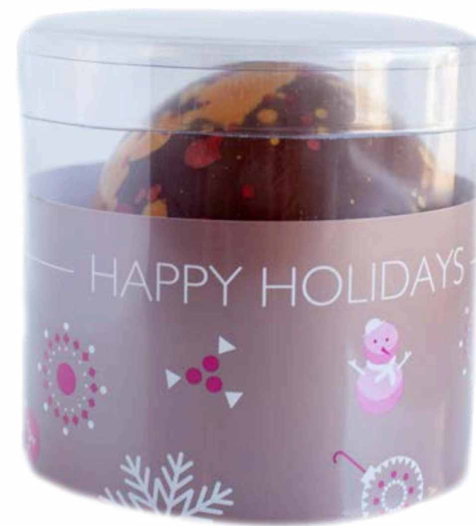
HOT CHOCOLATE BOMB $16