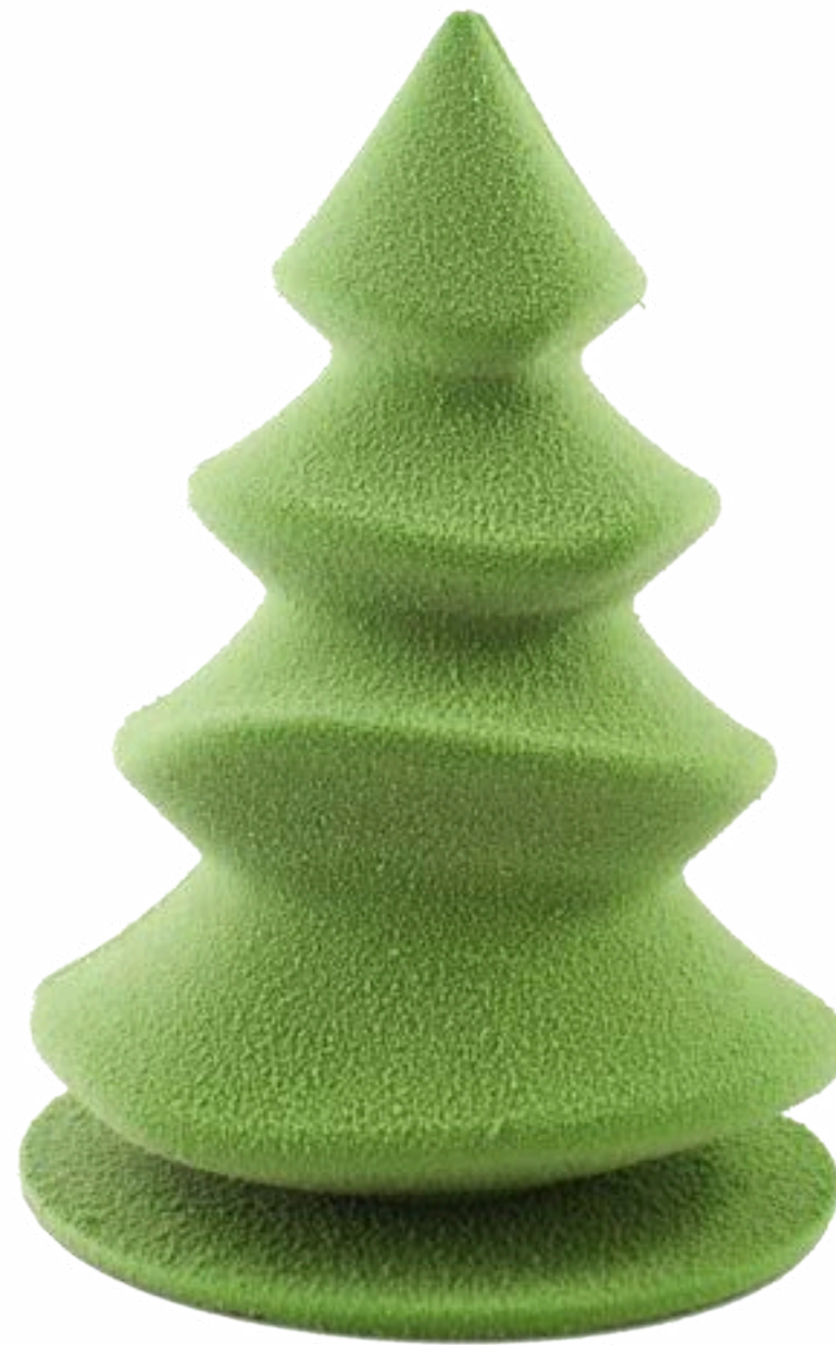
5" GREEN TREE $24

Spread holiday cheer with our handcrafted chocolate sculptures, made by skilled chocolatiers using premium chocolate. From festive reindeer to charming penguins, these delicious creations make the perfect gift for friends, family, coworkers, or employees. Beautifully designed and irresistibly indulgent, they're sure to impress and delight this holiday season!