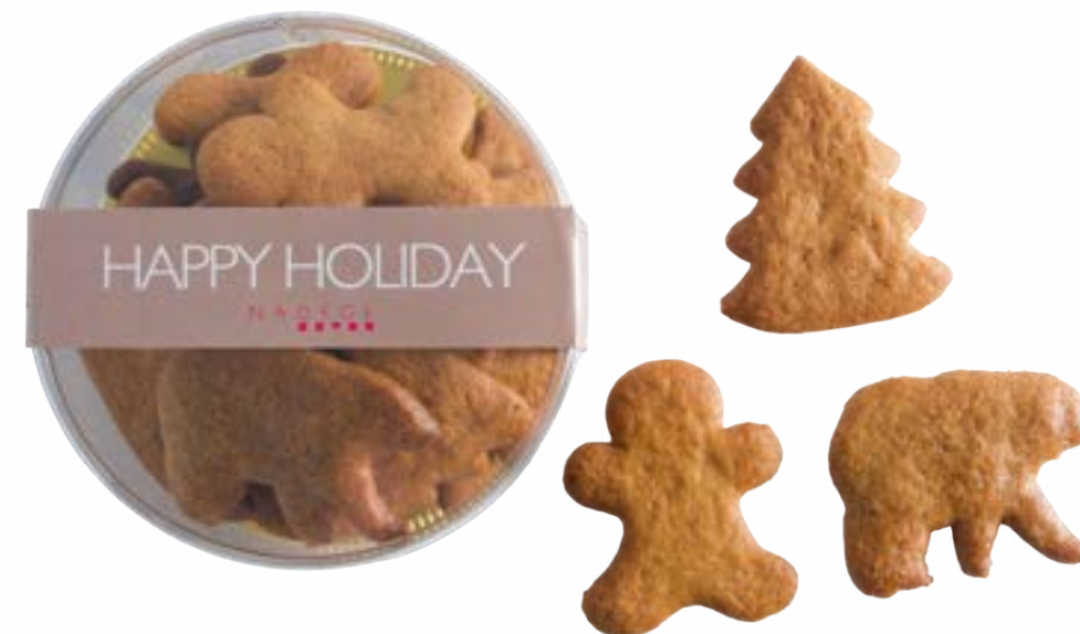
GINGERBREAD COOKIES $11