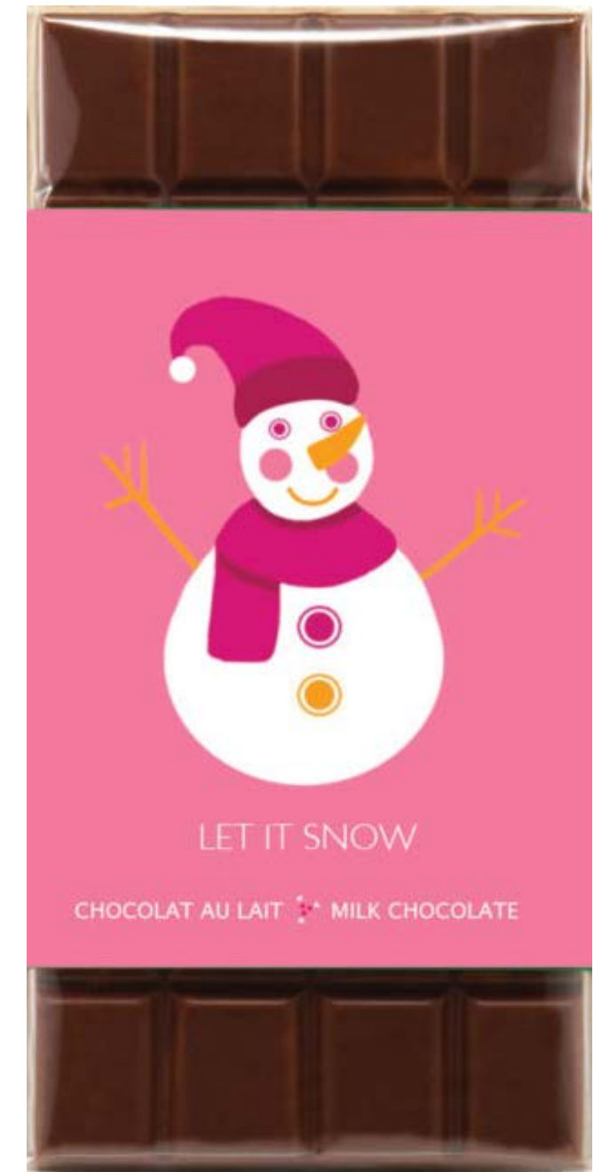
Milk Chocolate tablet with vanilla marshmallow, hazelnuts, candied orange & dried cranberry 100g $16.50