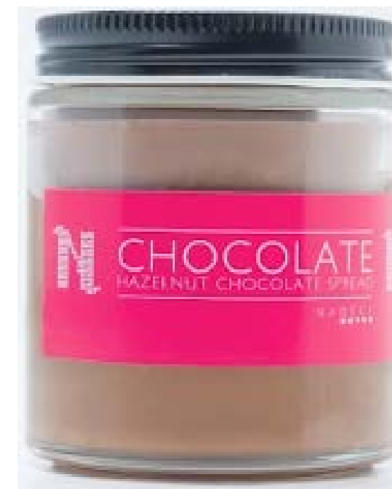
HAZELNUT CHOCOLATE SPREAD $14