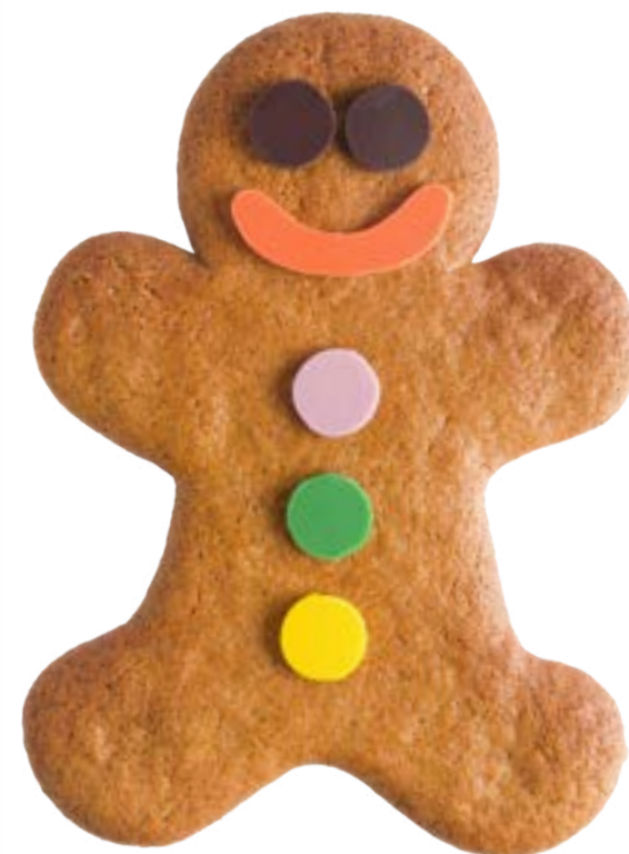
GINGERBREAD MAN $13