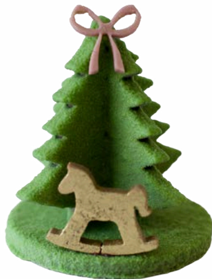
2.5" MINI HOLIDAY TREE $12 AVAILABLE IN MILK OR DARK CHOCOLATE