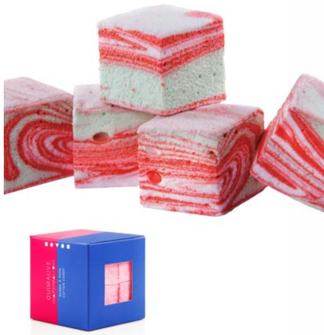
GUIMAUVE/MARSHMALLOW $11 CANDY CANE, COTTON CANDY, CASSIS RASPBERRY & STRAWBERRY