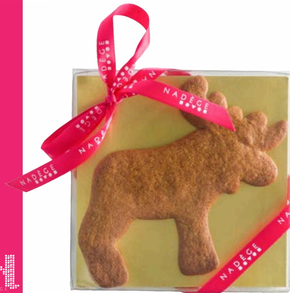
GINGERBREAD MOOSE $6