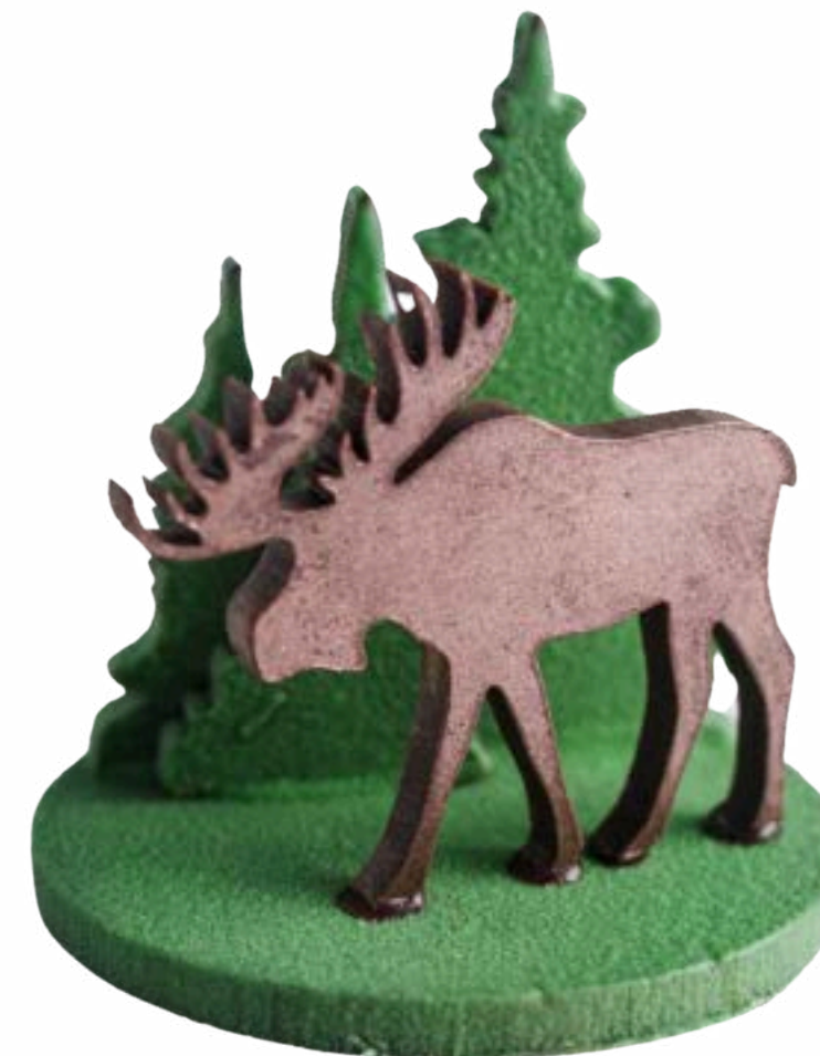
2.5" MINI MOOSE IN FOREST $12 AVAILABLE IN MILK OR DARK CHOCOLATE