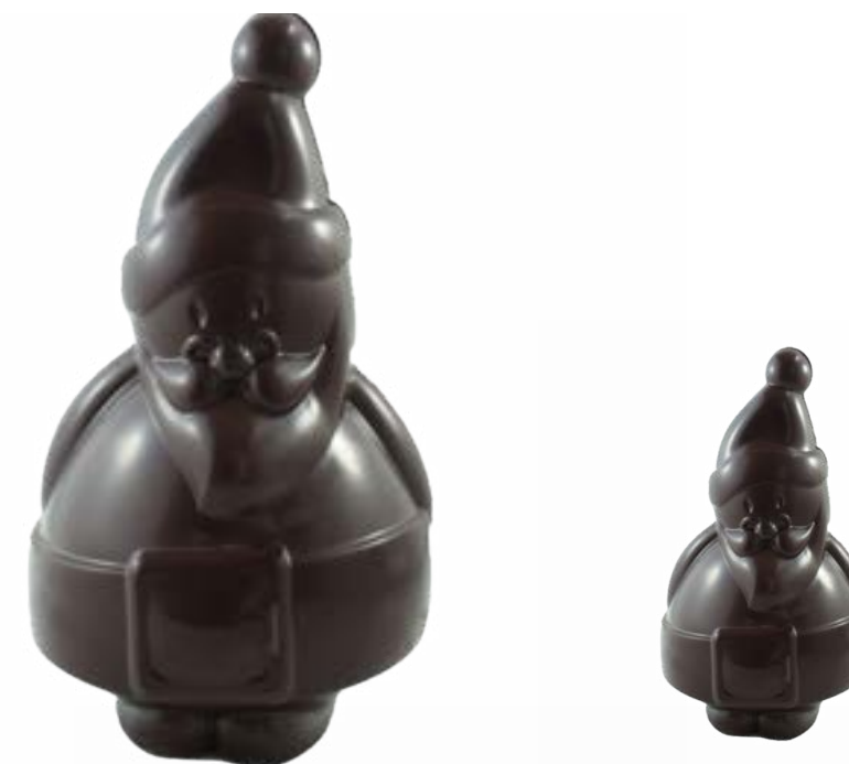
5" LARGE SANTA $23.50 AVAILABLE IN MILK OR DARK CHOCOLATE