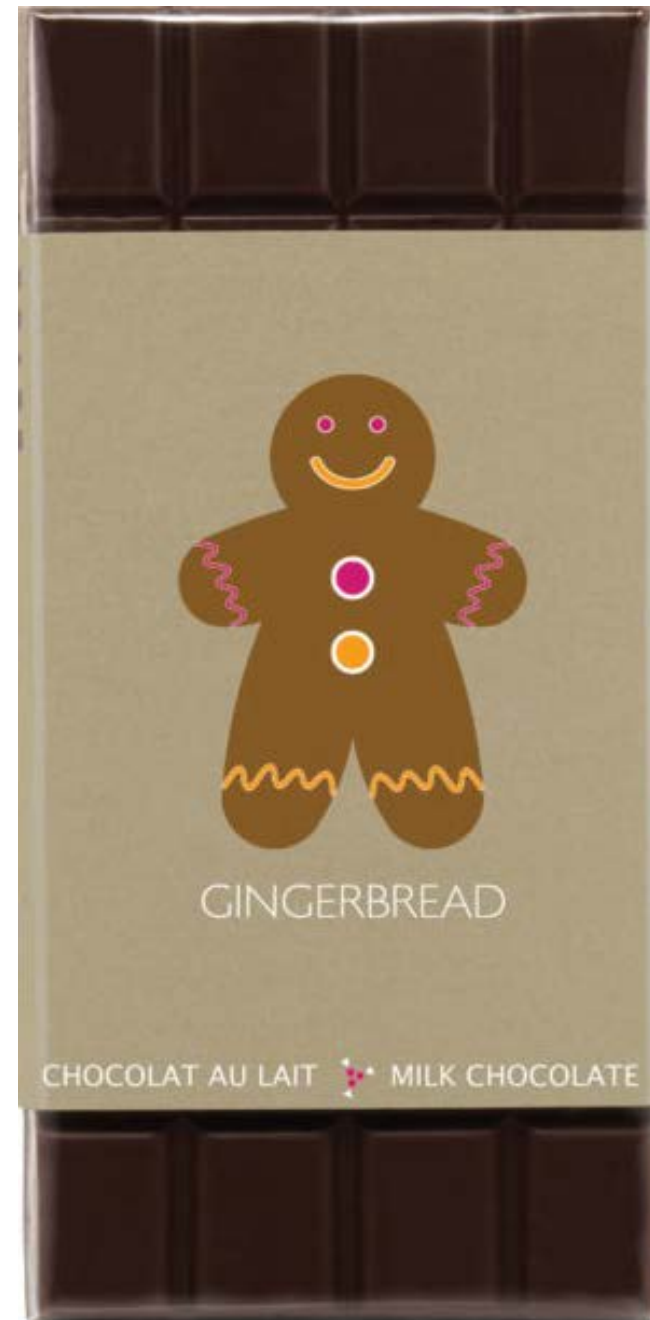
Housemade Gingerbread & Milk Chocolate 100g $16.50