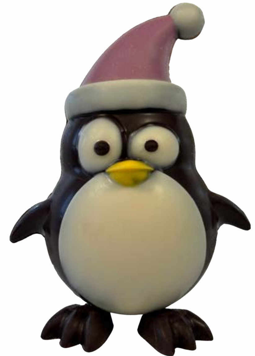
6" PENGUIN SCULPTURE $34