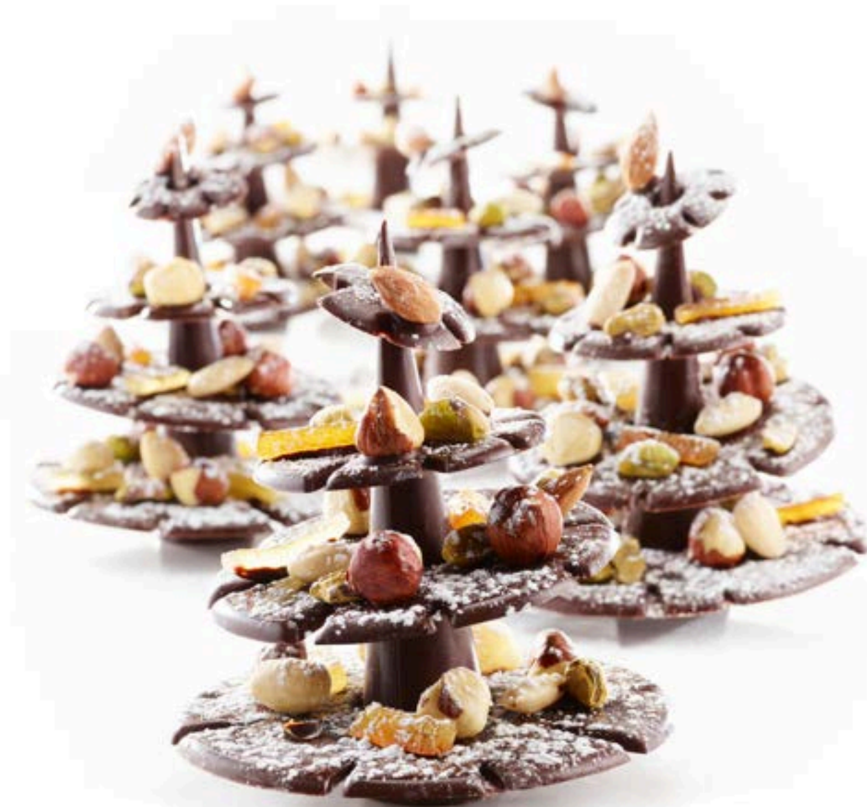
5" MENDIANT TREE $27