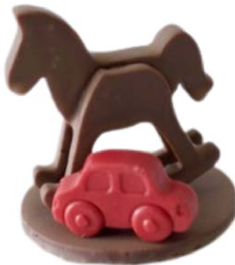
2.5" ROCKING HORSE $12 MILK CHOCOLATE ONLY ADD'L COLS: PINK, GREEN, YELLOW & ORANGE