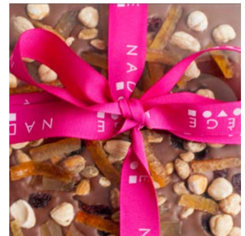
SQUARE MENDIANTS $32 MILK OR DARK CHOCOLATE