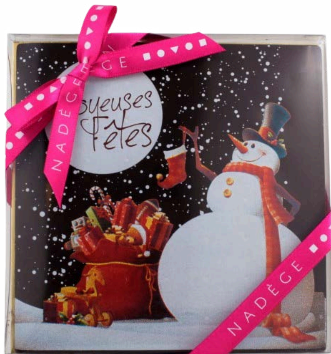
CHOCOLATE POSTCARD $18.50