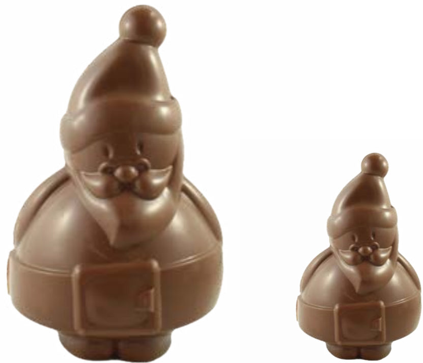
3" MINI SANTA $5.50 AVAILABLE IN MILK OR DARK CHOCOLATE